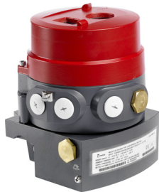
Neles ValvGuard™ Intelligent valve controllers for emergency depressurizing