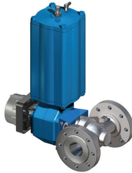
Top entry valves