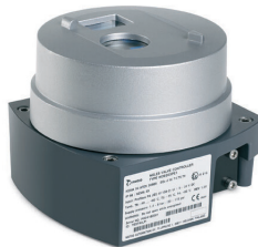
ND9000™ Intelligent valve controllers for operational depressurizing

The required capacity and noise requirement can be met and designed according to specifications. Common solution using: