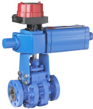
Trunnion mounted ball valves

The valve type selection depends on the process design conditions and customer specifications. Our offering includes valves for all depressurizing applications from operational to demanding, complex emergency depressurizing. Our product portfolio for depressurizing applications comprises of: