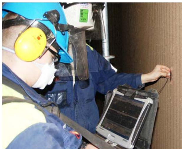
Figure 2. Boiler tube deposit inspection system in use