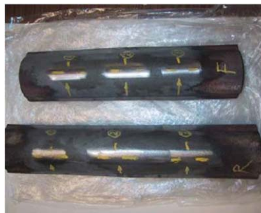
Figure 3. Tube preparation completed