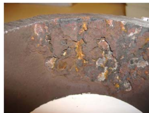
Figure 1. Example of thick localized deposit